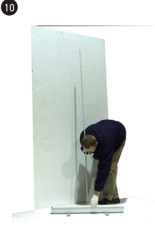
Pull the graphic out of the casing while holding the pole.