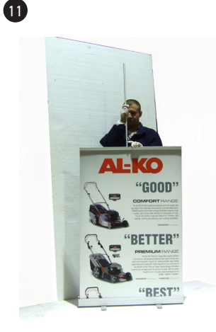
Completely unroll the graphic and fix it to the pole.