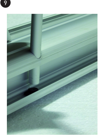
Fit the pole into the casing.