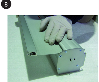
Roll the entire graphic into the casing.