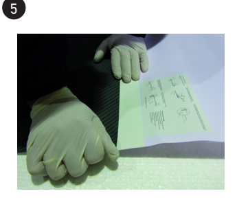
Continue applying the graphic until the full width is taped.