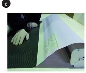
Once the graphic is applied to the tape, firmly press down over the full width to ensure proper adhesion.