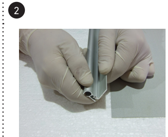
Open the hanger.