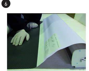
Once the graphic is applied to the tape, firmly press down over the full width to ensure proper adhesion.