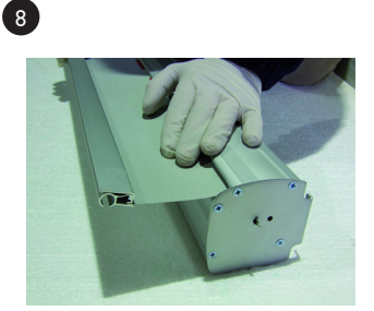
Roll the entire graphic into the casing.