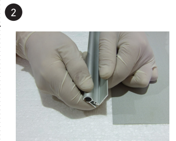
Open the hanger.