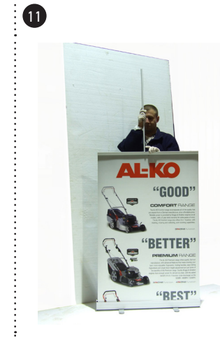
Completely unroll the graphic and fix it to the pole.