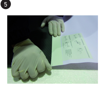
Continue applying the graphic until the full width is taped.