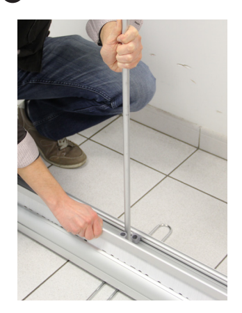
Remove the graphic from the base while holding the mast.