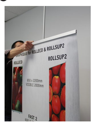
Unroll the graphic until the top and attach it to the mast.