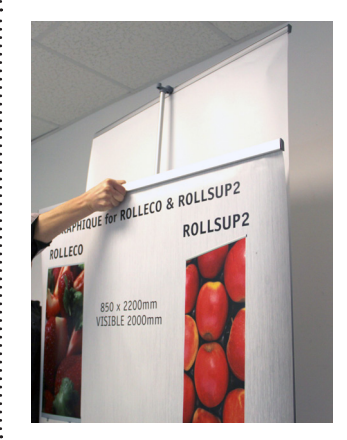
Repeat steps 10 to 11 for the second graphic.