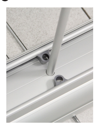
Install the mast into the base.