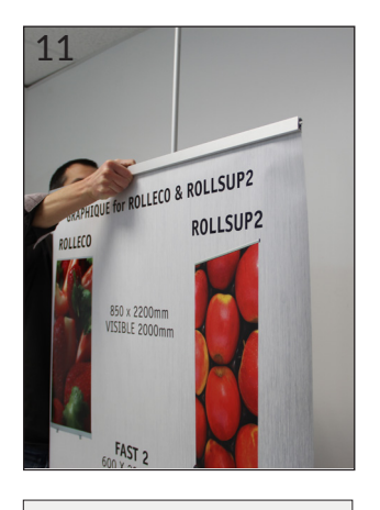
Unroll the graphic until the top and attach it to the mast.