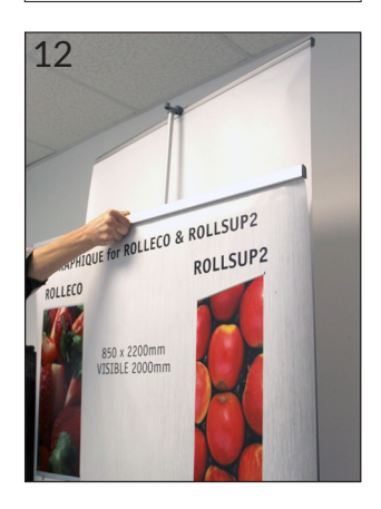
Repeat steps 10 to 11 for the second graphic.