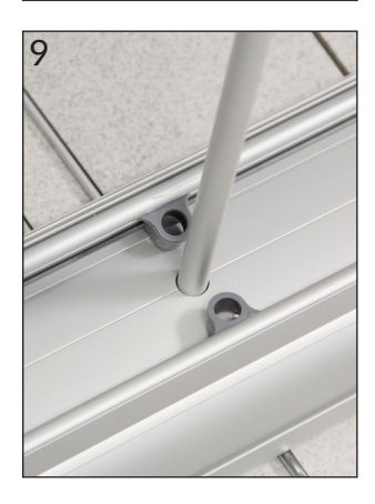
Install the mast into the base.