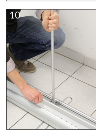
Remove the graphic from the base while holding the mast.